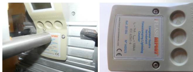
I FLASH REPORT® counter during and after impact

After the test, the displayed counting value of the lightning impacts counter mustn't have been increased or decreased (especially for electromechanical lightning strikes counters).