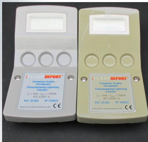
I FLASH REPORT® counter before and after UV ageing

The counter meets this test requirement. Indeed, there is no sign of deterioration, no crack visible with normal or corrected vision.