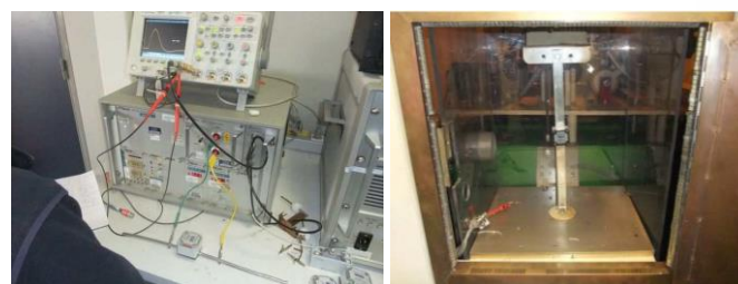
IONICOUNT® Counter during electrical tests